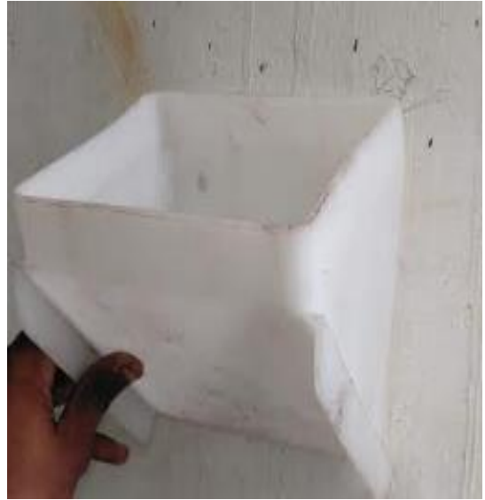
Buckets (Without Holes) (7*6*5 inch)